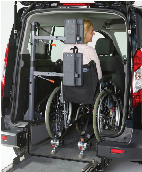
Folded out head and back rest for wheelchair area.

Head and back rest – the patented safety system for wheelchair occupants