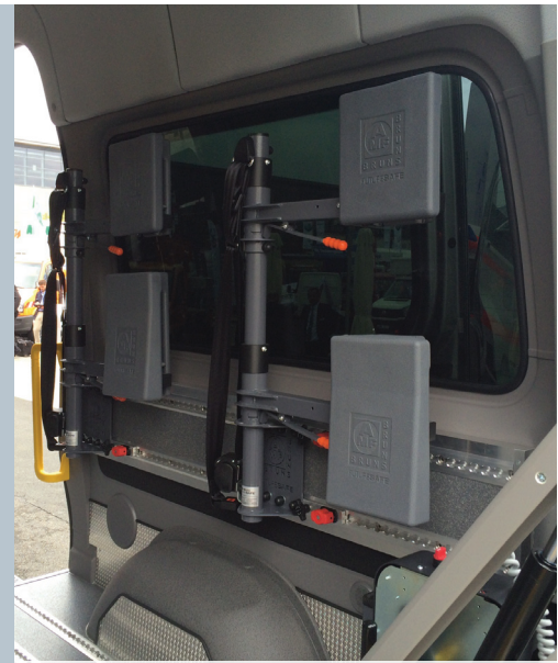
FUTURESAFE® fixed to the wall, easily adjustable along the tracks.