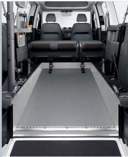
FUTURESAFE® fixed to the floor, swivelled to the side for space-saving.